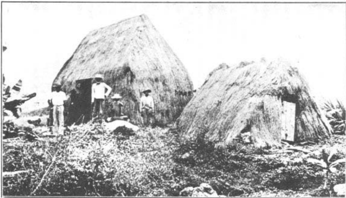
HAWAIIAN GRASS HOUSES

Then came the memory of that excursion made in 1783 to Puna for the sake of robbery and possible murder. The king wondered what had become of the men who had attacked him. He had gone to Hilo and was having a fine fleet of wide and deep canoes made in the splendid koa forests back of Hilo. While waiting here, some time between the years 1796 and 1802, he determined to find the men of the splintered paddle. He knew that these men might have changed their residence from the Puna district to Hilo. So he sent messengers throughout both districts summoning all the people to a great meeting in Hilo. Certain large grass houses were set apart for the large assembly. The Hilo people were separated from the families of the other district.