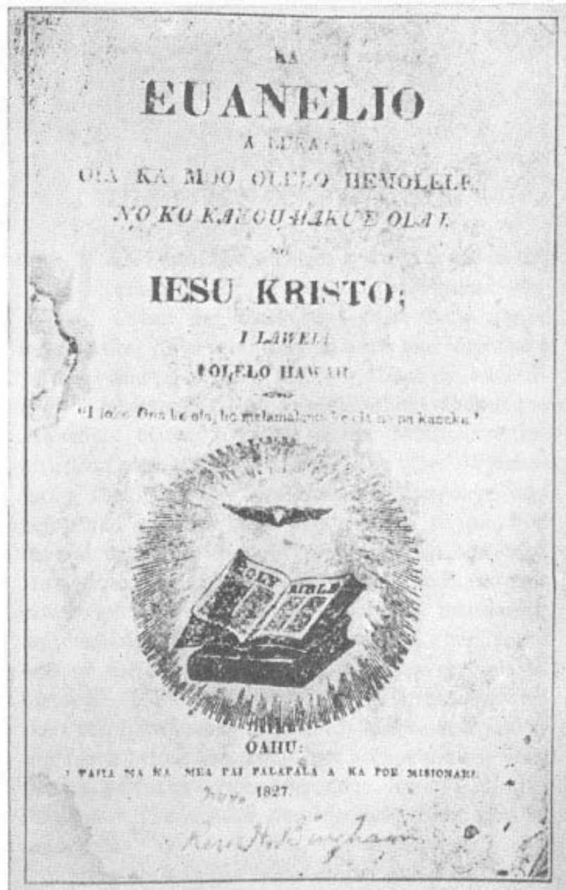
FIRST BIBLE PRINTING, 1827 GOSPEL OF LUKE

will be a progress exceeding that of any other mission to any heathen country having a language not previously written or reduced to order." It was a little over twelve years after the first pages were prepared before the complete Bible was in print.