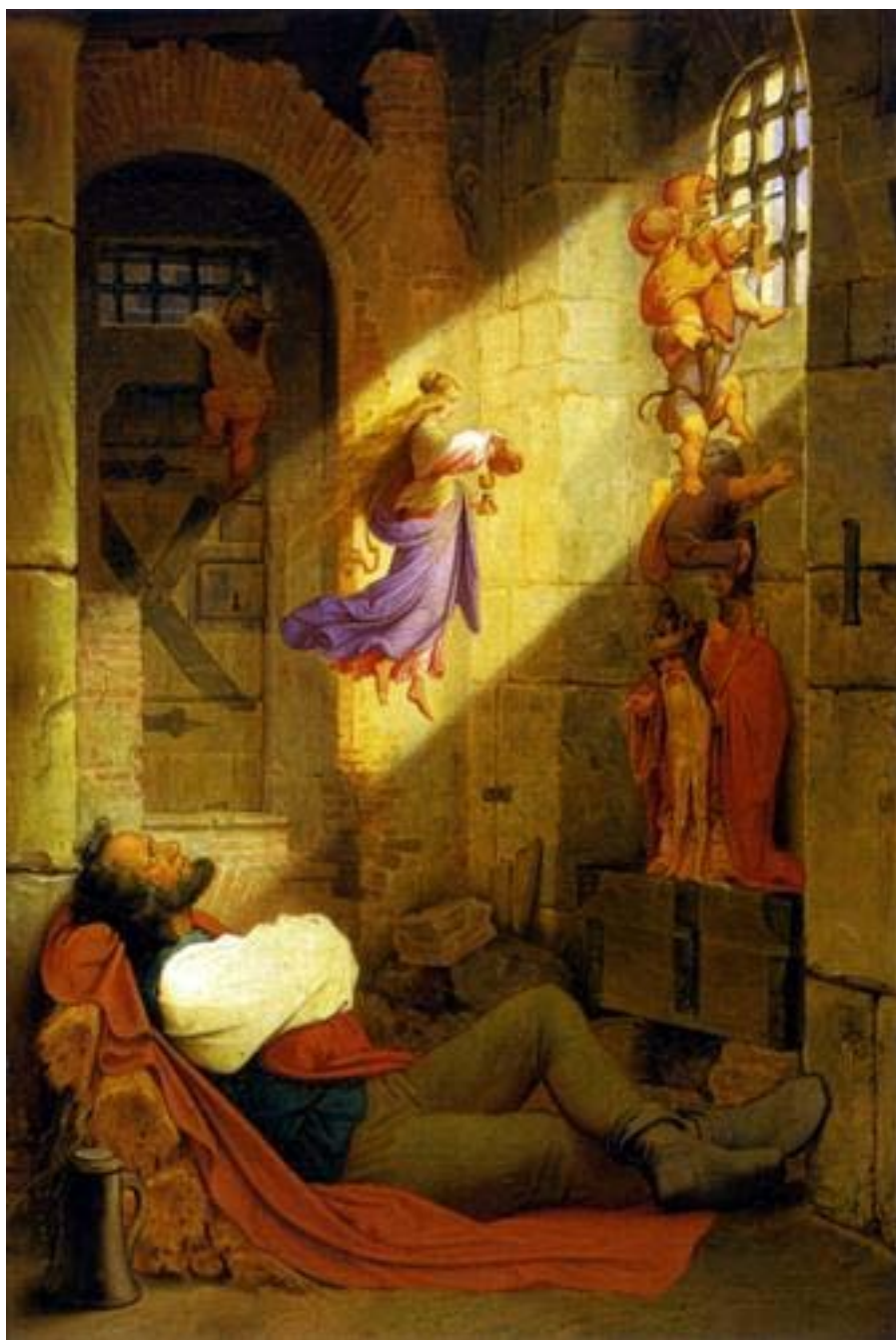
SCHWIND, The Dream of the Prisoner