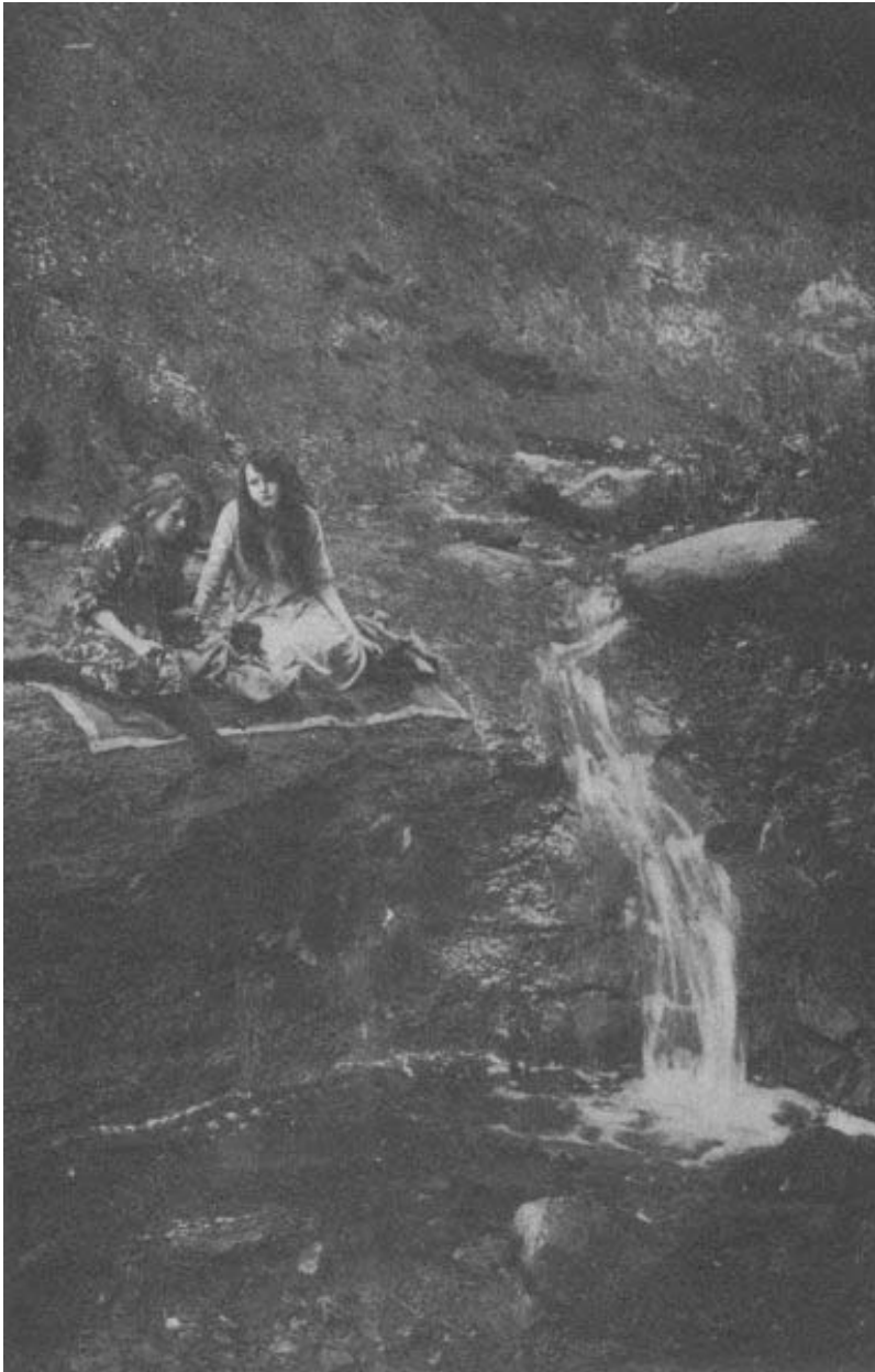
A VIEW OF THE BECK IN 1921