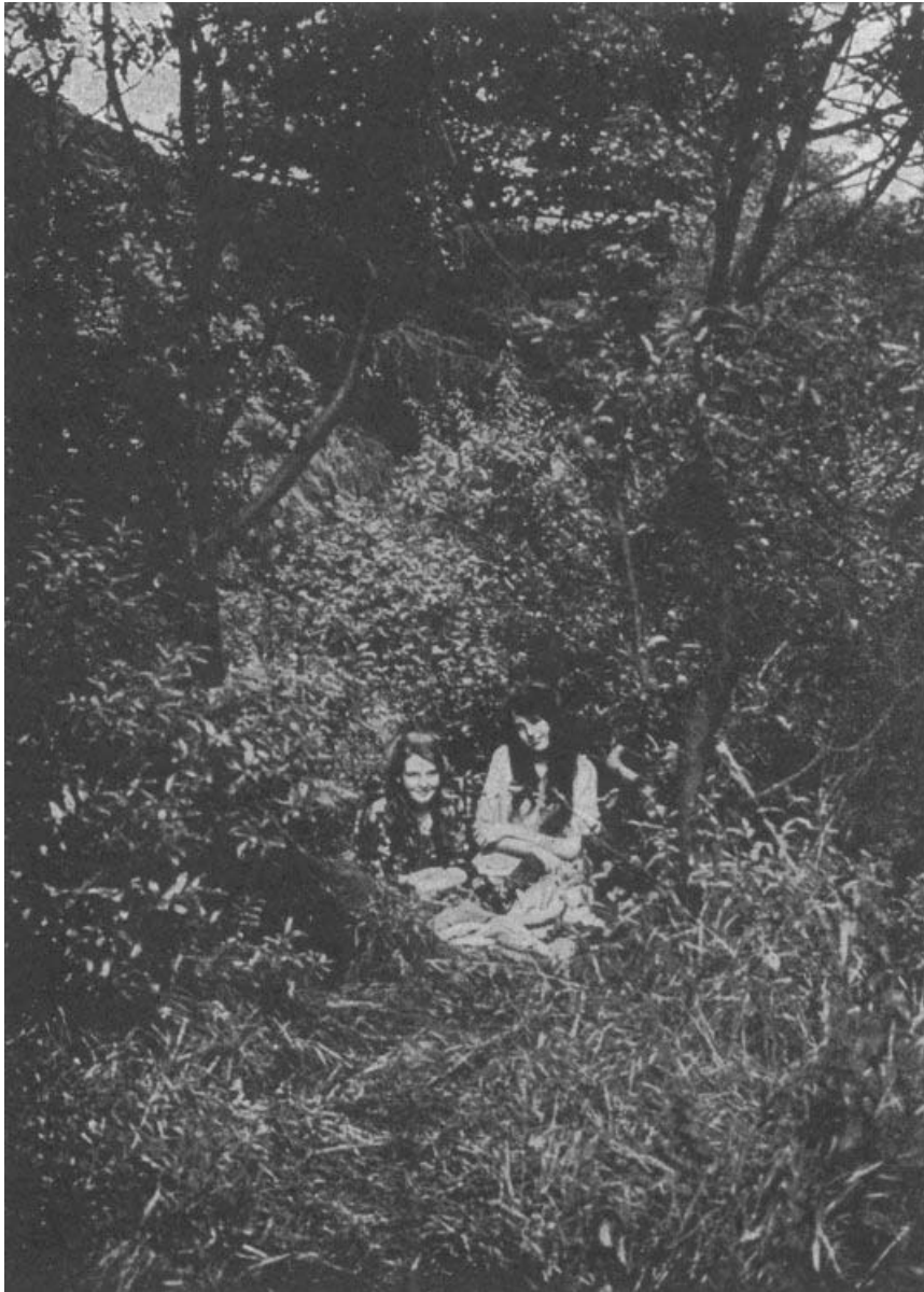
THE TWO GIRLS NEAR THE SPOT WHERE THE LEAPING FAIRY WAS TAKEN IN 1920

Here, certainly, the advocates of sunstroke have a strong, though by no means a final, case. Mr. Baring-Gould's next illustration is a sounder one.