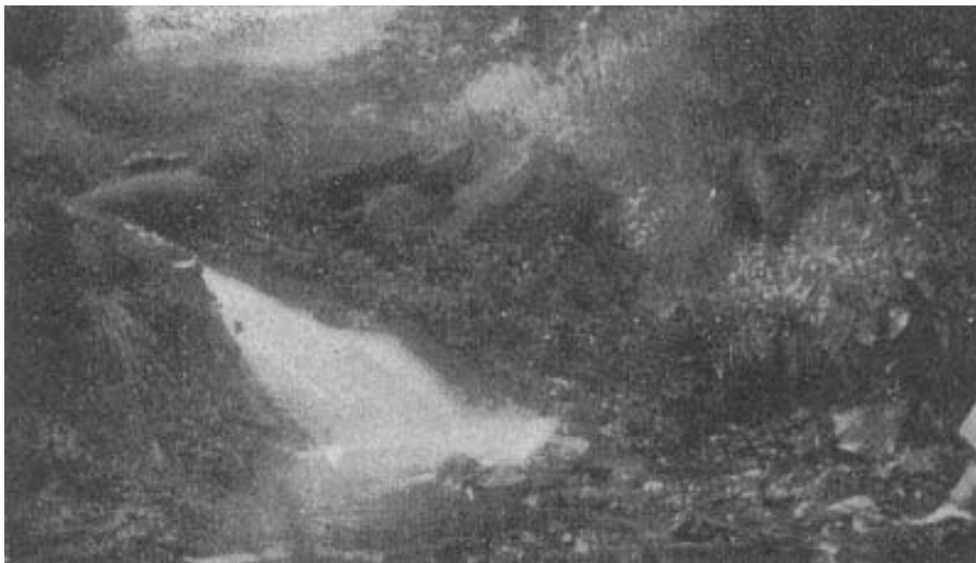
THE FALL OF WATER JUST ABOVE THE SITE OF LAST PHOTOGRAPH