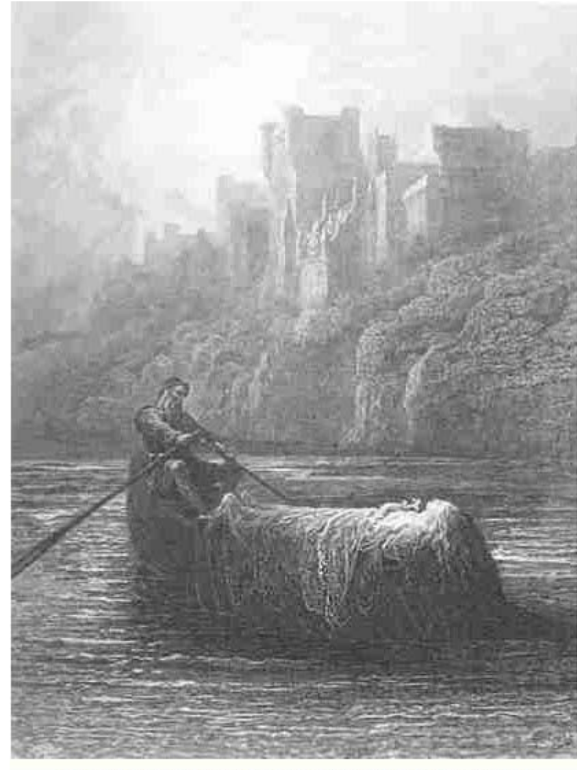
The Body of Elaine on Its Way to King Arthur's Palace

All but her face, and that clear-featured face Was lovely, for she did not seem as dead, But fast asleep, and lay as though she smiled.