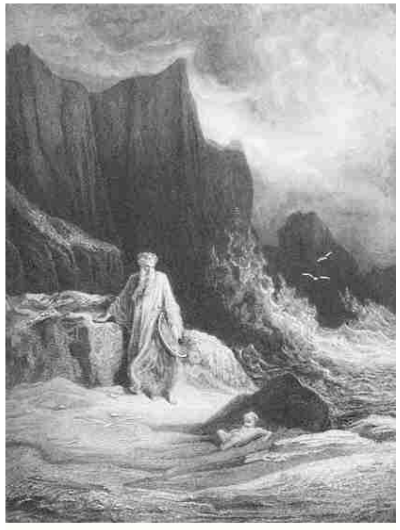
The Finding of King Arthur

Beheld, so high upon the dreary deeps It seemed in heaven, a ship, the shape thereof A dragon winged, and all from stern to stern Bright with a shining people on the decks, And gone as soon as seen. And then the two Dropt to the cove, and watched the great sea fall, Wave after wave, each mightier than the last, Till last, a ninth one, gathering half the deep And full of voices, slowly rose and plunged