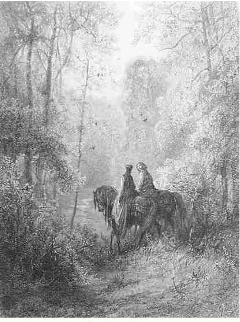
The Dawn of Love