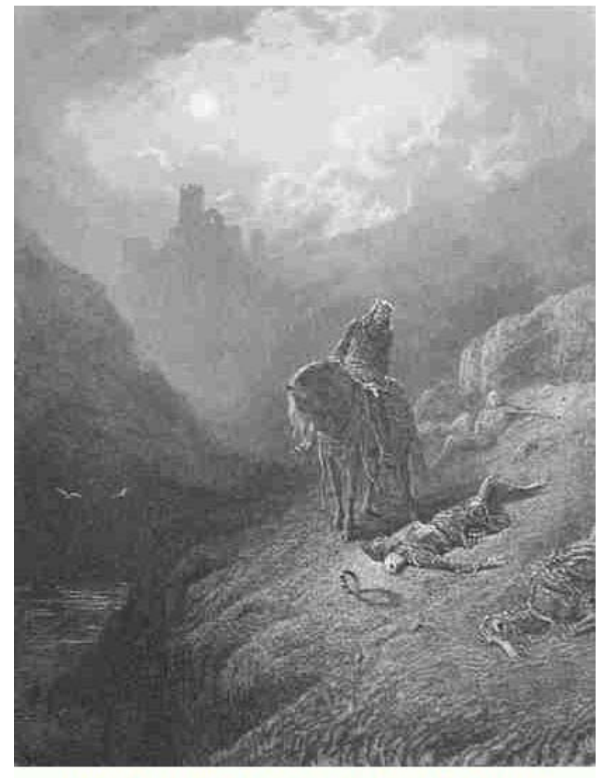
King Arthur Discovering the Skeletons of the Brothers

When all were won; but meaning all at once To snare her royal fancy with a boon Worth half her realm, had never spoken word.