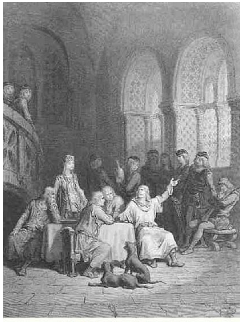
Lancelot Relating His Adventures