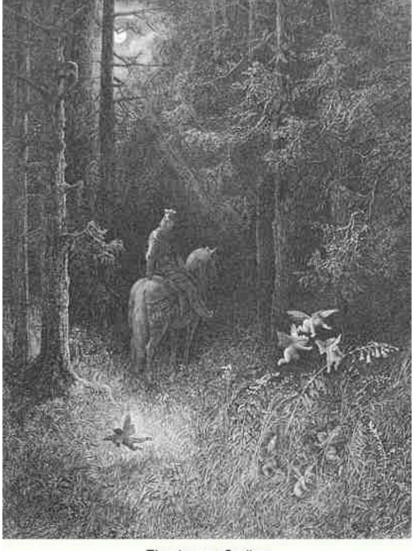
The Joyous Sprites

To whom the little novice garrulously, 'Yea, but I know: the land was full of signs And wonders ere the coming of the Queen. So said my father, and himself was knight Of the great Table — at the founding of it; And rode thereto from Lyonnesse, and he said That as he rode, an hour or maybe twain