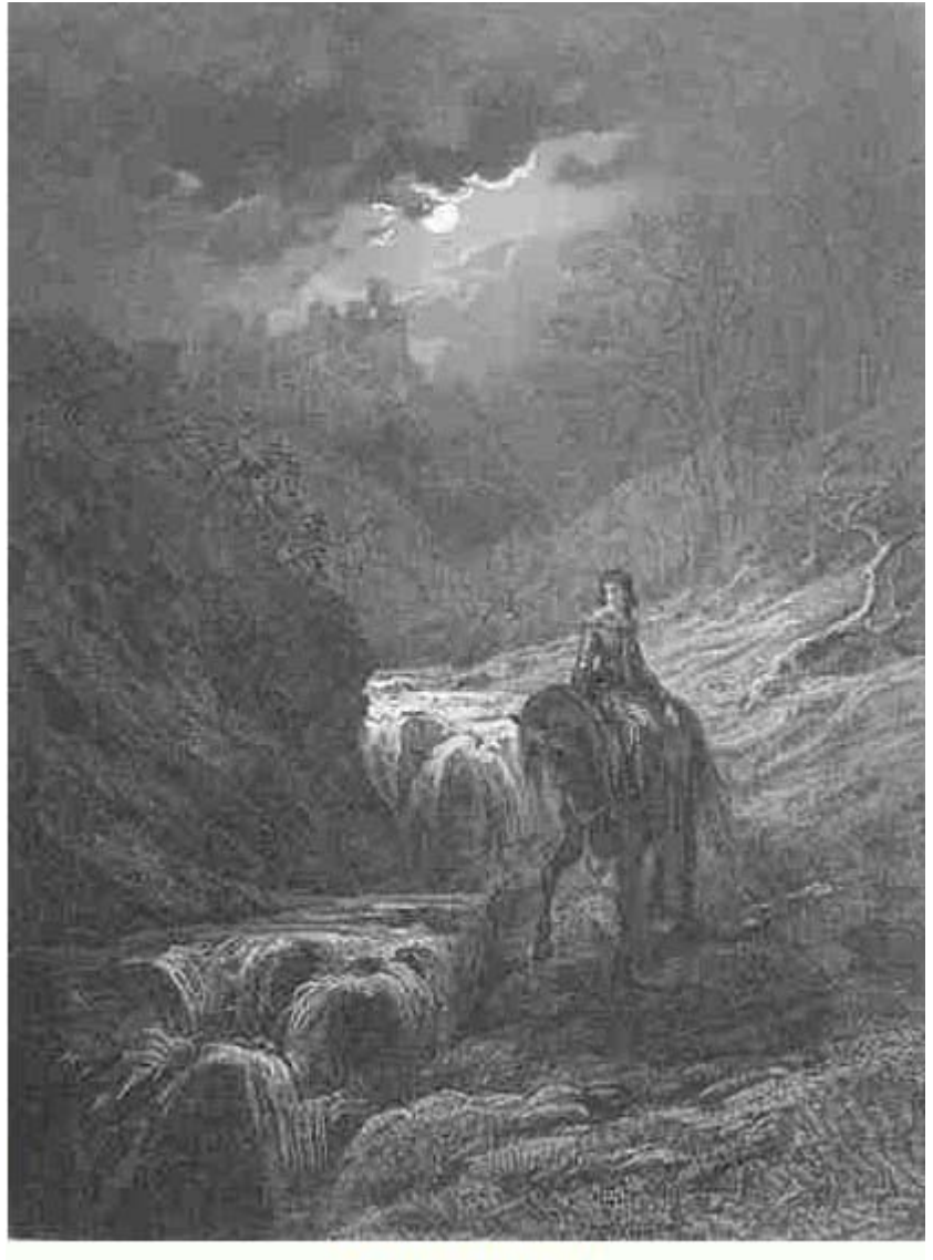
The Moonlight Ride

So the stately Queen abode For many a week, unknown, among the nuns; Nor with them mixed, nor told her name, nor sought, Wrapt in her grief, for housel or for shrift, But communed only with the little maid, Who pleased her with a babbling heedlessness