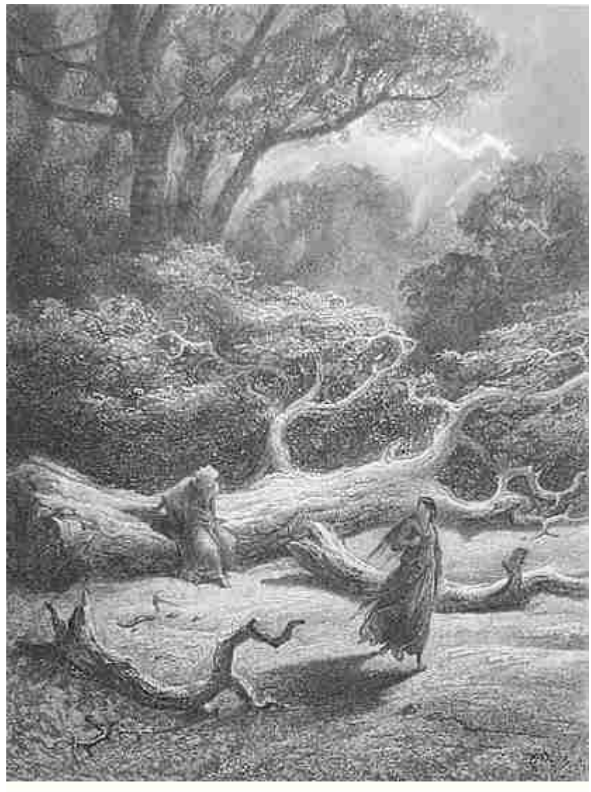
Vivien Encloses Merlin in the Tree