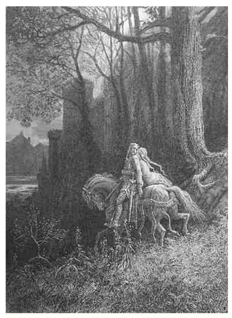
Geraint and Enid Ride Away

In rest, and made as if to fall upon him.