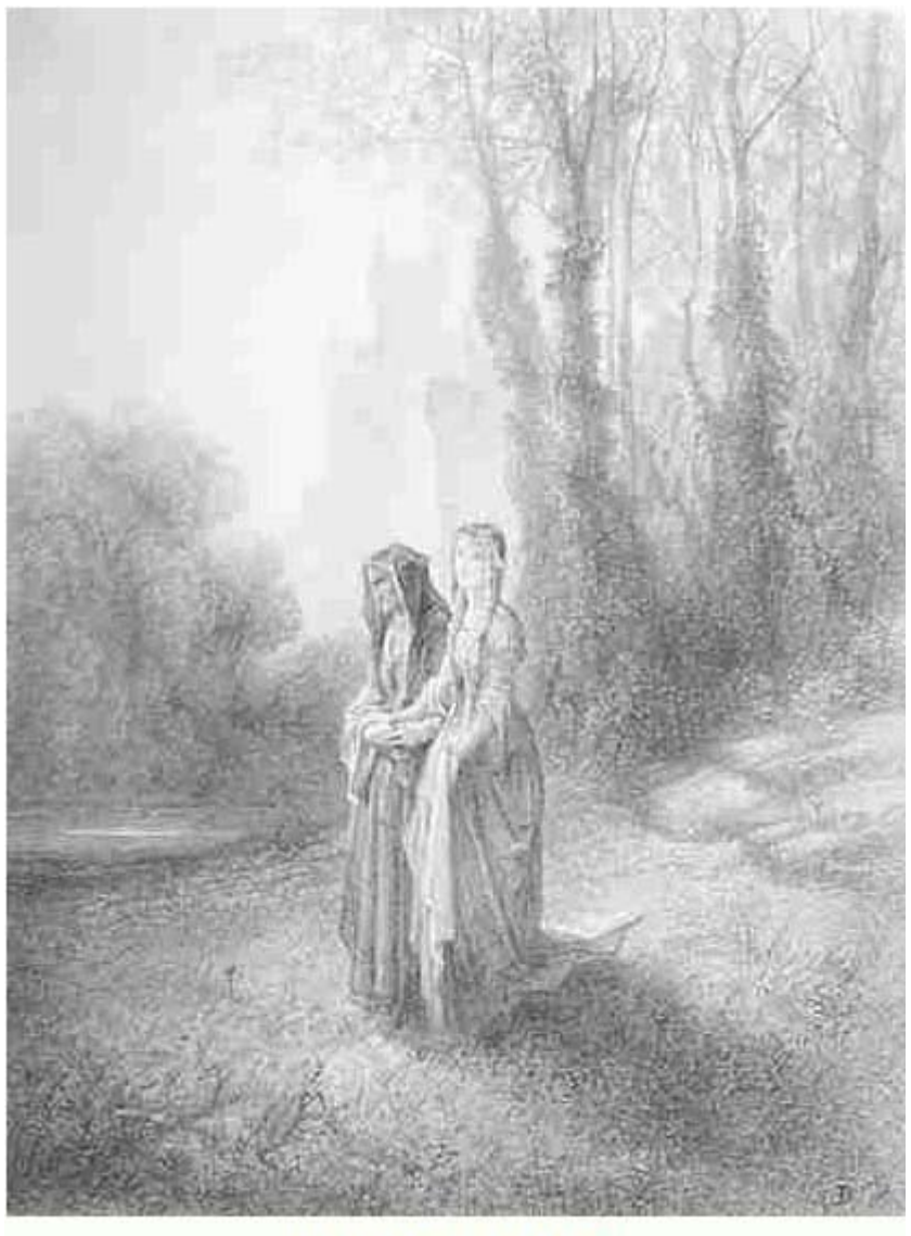
Enid and the Countess