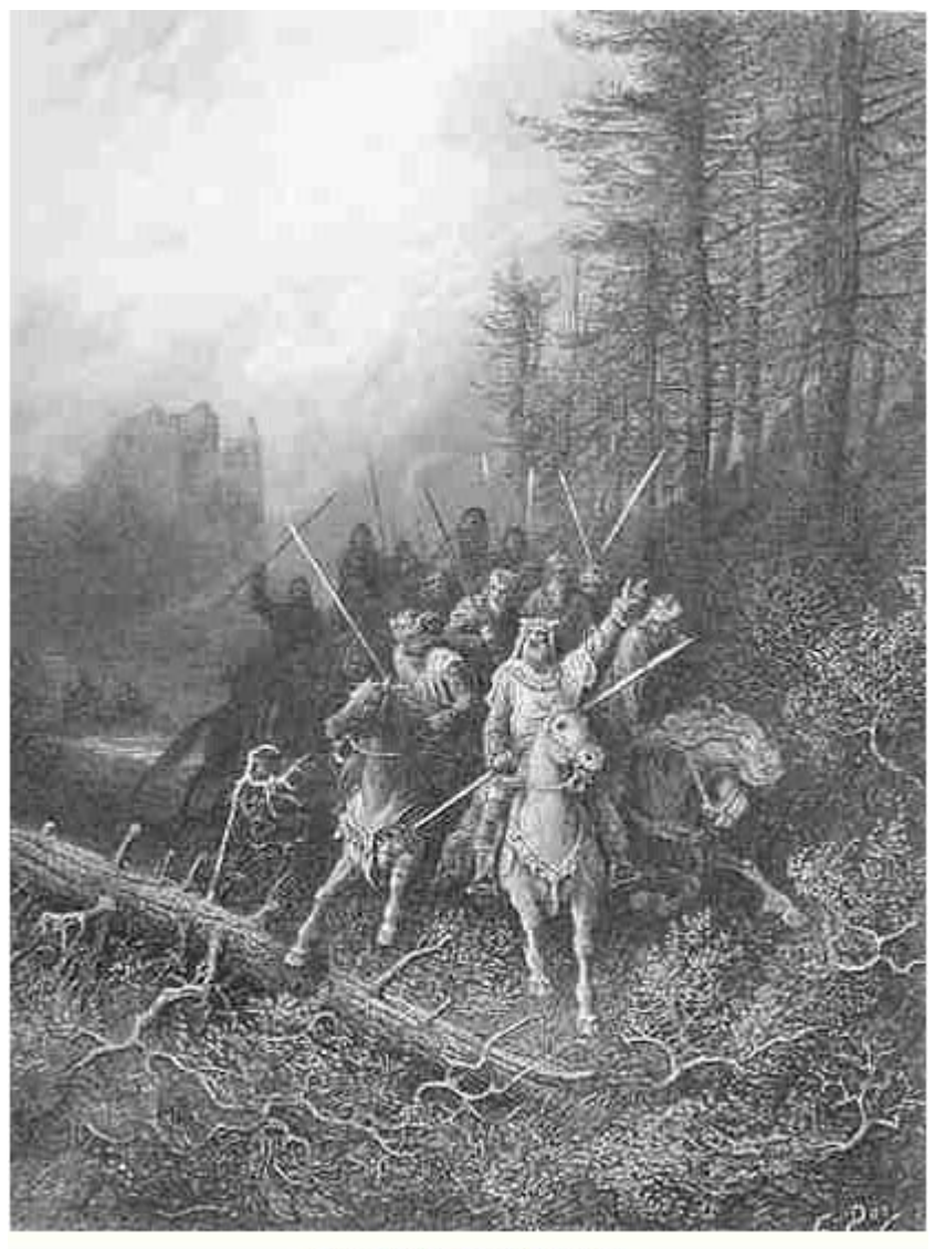
The Knights' Progress