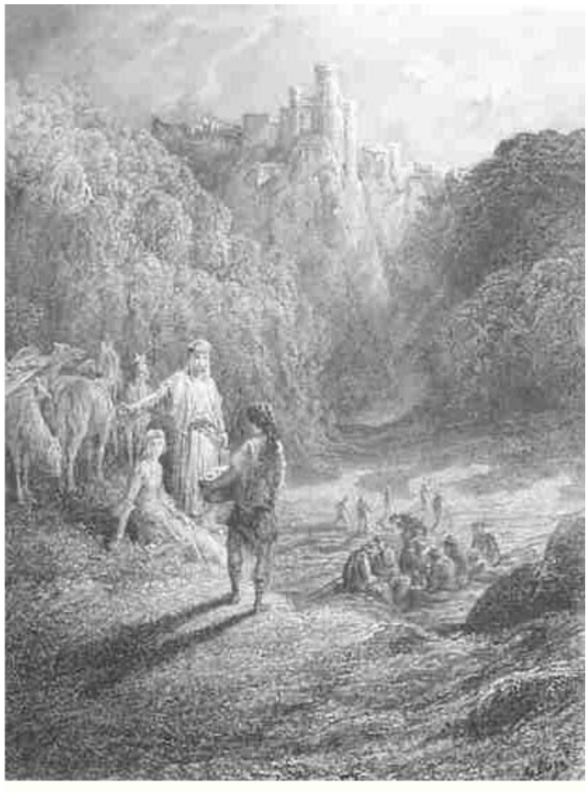
Geraint and Enid in the Meadow

And into no Earl's palace will I go. I know, God knows, too much of palaces! And if he want me, let him come to me. But hire us some fair chamber for the night, And stalling for the horses, and return With victual for these men, and let us know.' 'Yea, my kind lord,' said the glad youth, and went,