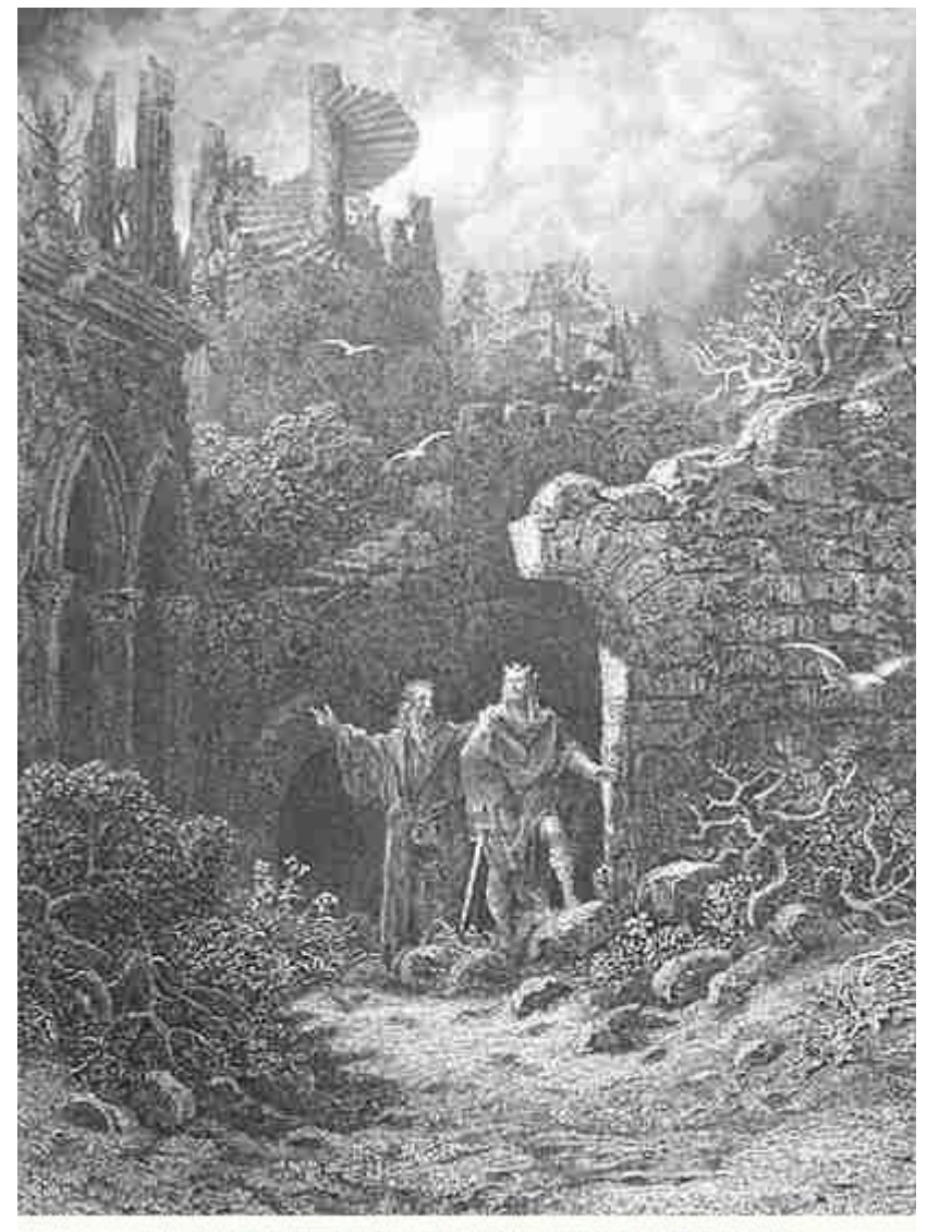
Yniol Shows Prince Geraint His Ruined Castle

To curse this hedgerow thief, the sparrow-hawk: But in, go in; for save yourself desire it, We will not touch upon him even in jest.'