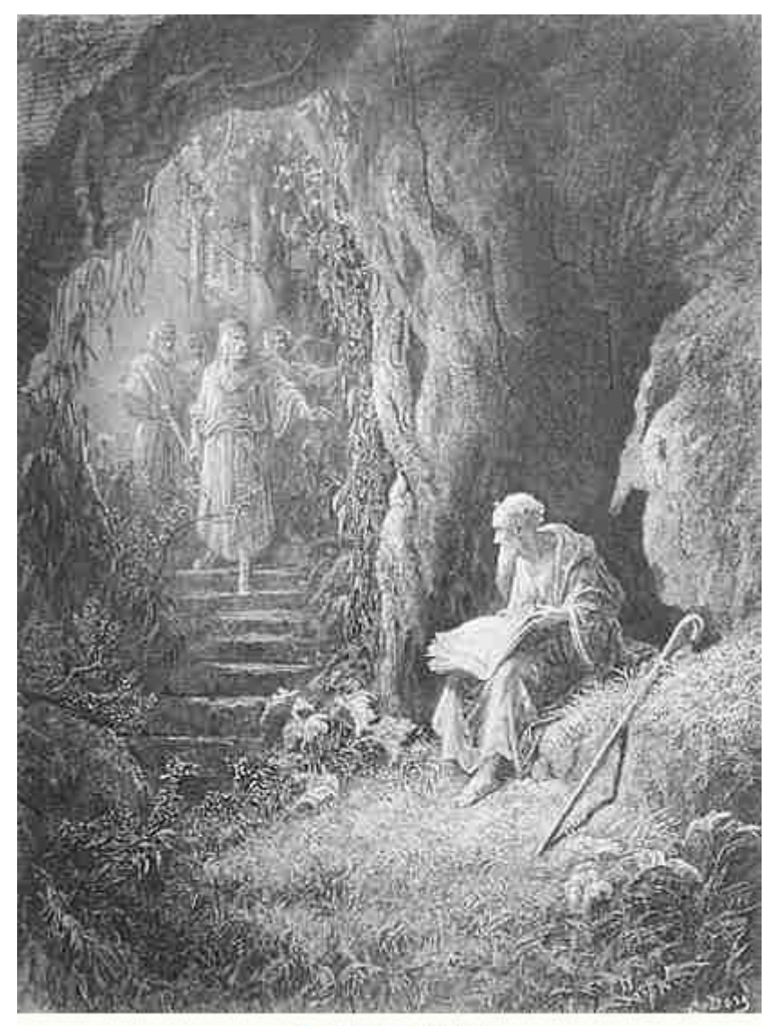
The Cave Scene

For help and shelter to the hermit's cave. 'Follow the faces, and we find it. Look, Who comes behind?'