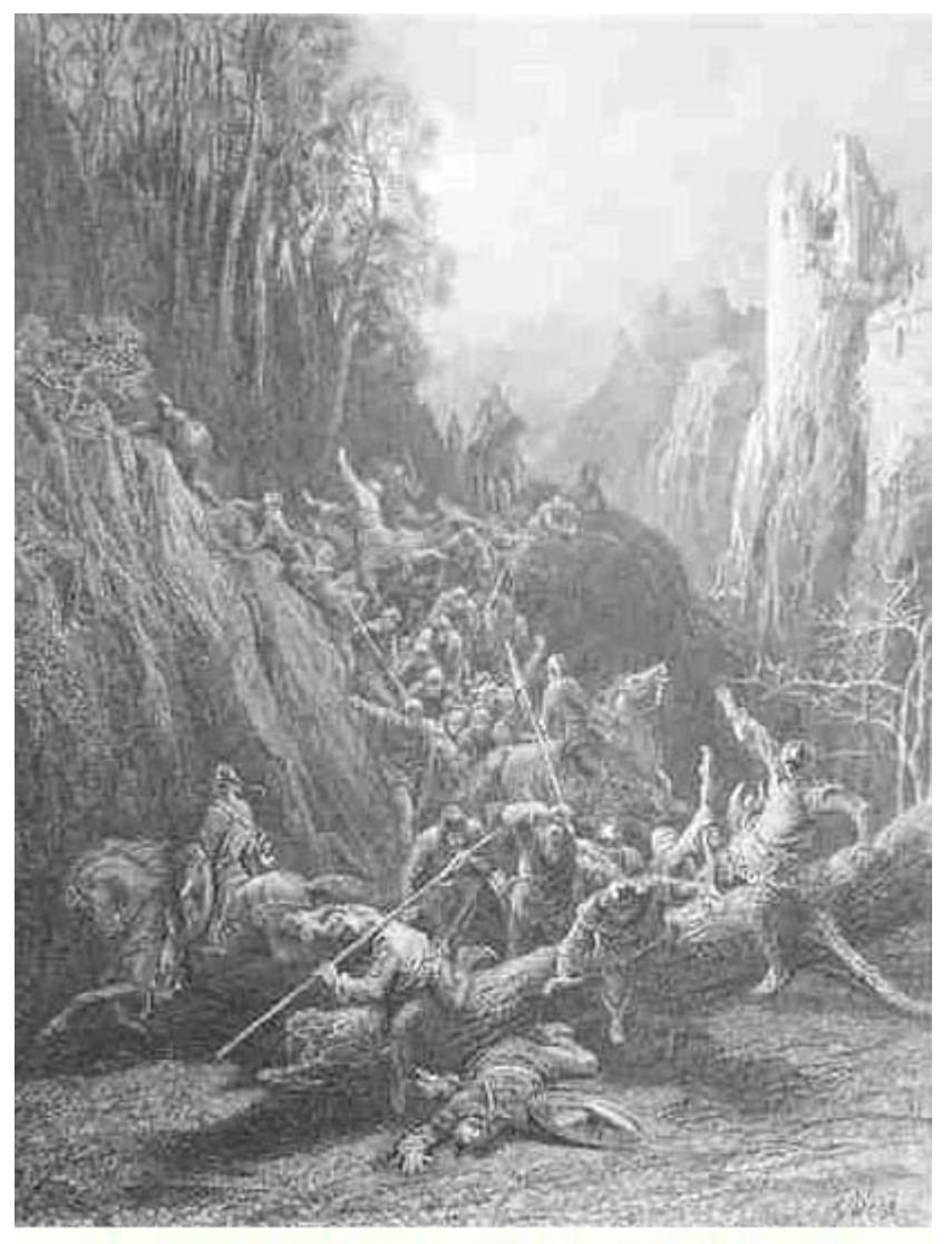
The Flight and the Boon Companions of Earl Limours